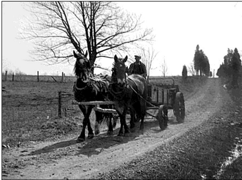
The lane leading from the Forty-foot Road to the former Luken farm in the 20 th century.